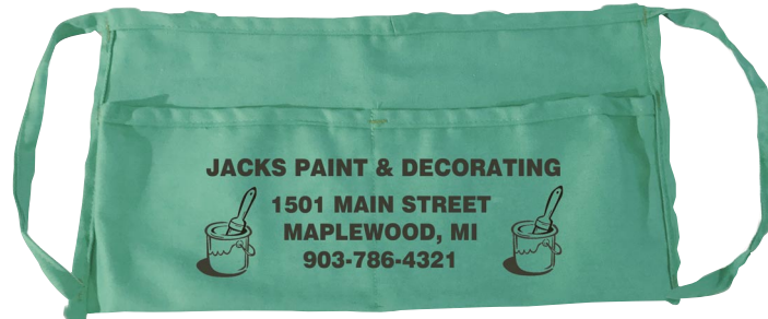
Standard imprint area is 4" x 15"